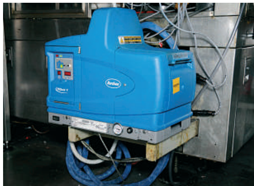
A ProBlue 4 melter unit is used to heat the hot-melt.