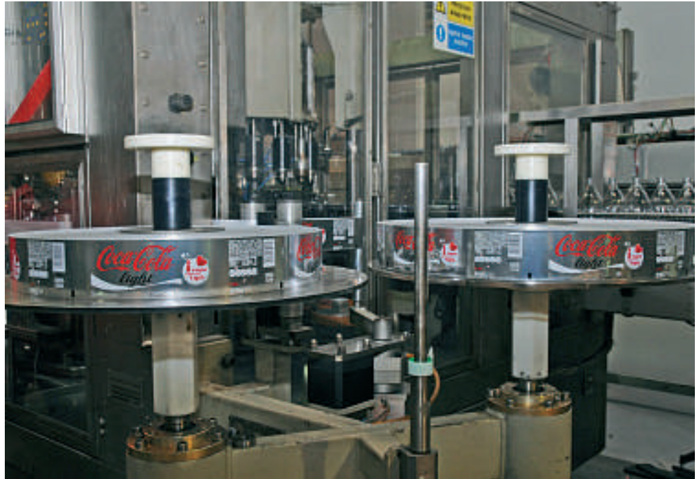
The labels are fed from the roll.

Two special adhesive types are validated for the Nordson system: Euromelt 150 from Henkel and Clarity 4167 from H.B. Fuller. Only the former is used in the Schimatari plant.