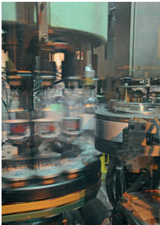
The labeling stations typically run in production with a speed of 24,000 and 20,000 bottles per hour respectively.