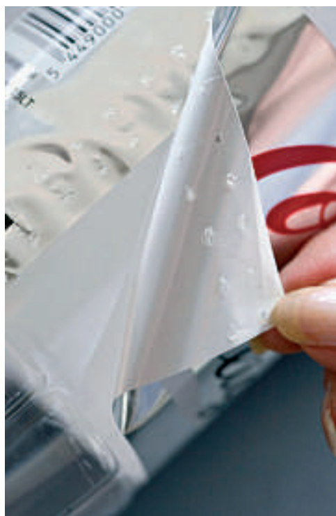
The adhesive dots become visible when viewed up close.

The applicators are mounted in bracket especially developed by Nordson that allows for precise positioning and height adjustment. A special feature of the bracket design is that the applicators can be pulled back into a service position.