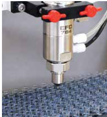
The unique design of the aseptic spray valve is critical for sterile fluid applications.

Similarly, aseptic spray valves also feature a fluid flow path that is free of any entrapment areas—a critical consideration in sterile and aseptic fluid applications that use low- to medium-viscosity fluids. An aseptic spray valve works best with a small gauge dispensing tip to produce uniform round spray patterns. Alternatively, some aseptic spray valves can be fitted with fan air caps for a wider area of coverage.