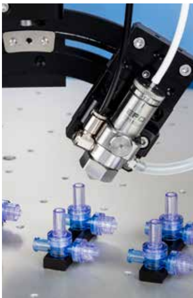
Required maintenance can greatly vary between valve systems.

All valves will eventually require maintenance, but some designs require more frequent repair than others. Here are some things to consider: