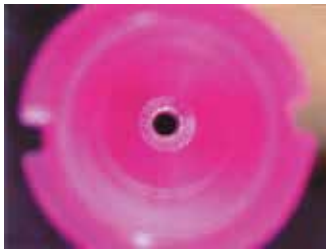
High-quality tip provides unobstructed fluid path.

Correct tip selection is very important to dispense valve performance. The best choice is using a tip with the largest possible internal opening for the intended application. This will prevent air bubbles from forming.