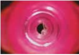
“Flash” inside hub of low-quality tip restricts fluid flow.