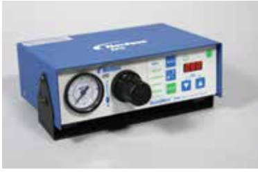
A dedicated valve controller at the dispensing station simplifies setup and helps valves cycle faster.

If your dispense valves are not cycling fast enough, the valve control system may not be compatible with the dispense valve.