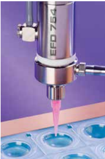
Tips should be selected based on the specific fluid and application.

Entrapped air can cause oozing and variations in shot size. Be sure to purge all air and fluid lines whenever setting up a system, refilling the fluid tank, or performing maintenance. Other recommendations include: