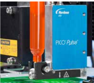
Jetting valves can dispense a wide range of fluids in volumes as small as 0.5 nanoliters at continuous speeds of up to 1500Hz, or 1500 shots per second, with exceptional process control.

Non-contact jetting systems are capable of dispensing a wide variety of fluids at speeds of up to 1500Hz, or 1500 shots per second. By combining high speed with exceptional accuracy, these systems allow medical products to be built more cost-effectively with consistently high quality.