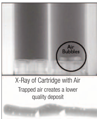
X-Ray of Cartridge with Air Trapped air creates a lower quality deposit