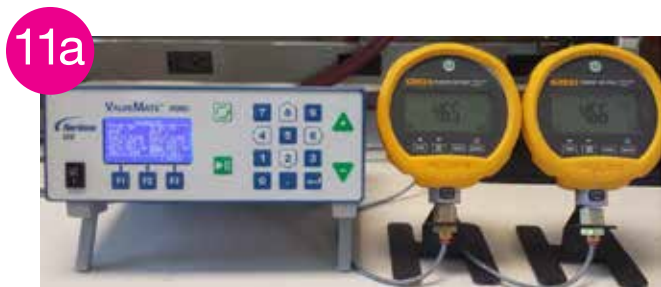
Pressure gauges BEFORE adjusting for a target pressure of 5 psi.