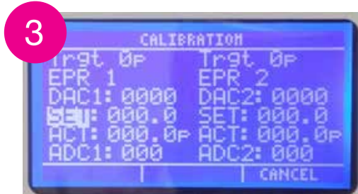
Calibration screen, SET selected.