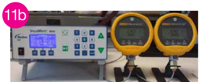
Pressure gauges AFTER adjusting for a target pressure of 5 psi.