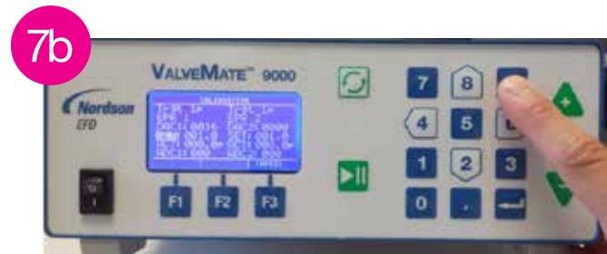
Modifying a parameter, coarse adjustment.