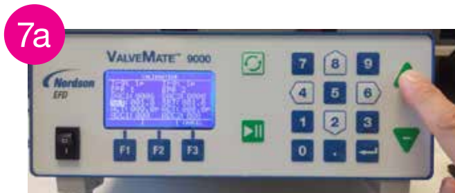
Modifying a parameter, fine adjustment.