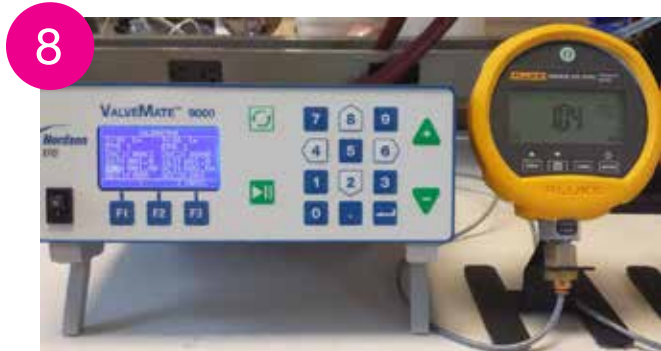
Pressure gauge reading target psi of 1.