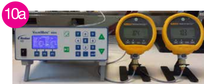
Both pressure gauges reading target EPR calibration of 1 psi.