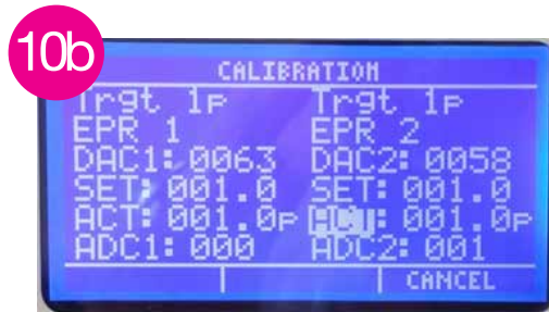
Calibration screen showing adjusted SET and ACT target psi readings of 1.