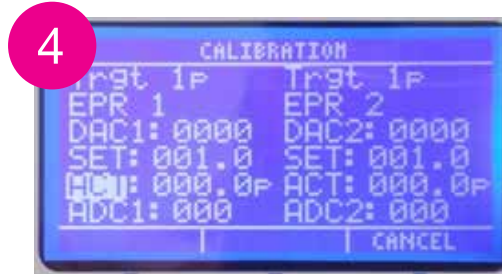
Calibration screen, ACT selected.