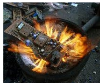
Figure 2: Burning E-waste to reclaim precious metals

There are both known and suspected risks associated with halogens in electronics. Hundreds of studies have been performed to determine the immediate and long-term effects of various halogenated compounds in both laboratory and outdoor environments. Both the groups supporting a ban on halogens and the groups opposing a ban reference specific studies as proof that their point of view is correct.