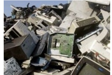
Figure 3: E-Waste

Despite the European studies, there remains a constituency lobbying against those BFRs that are persistent; there is concern over the long-term impacts on humans and animals. Testing of particular BFRs in pure form in laboratory environments has produced measureable effects given prolonged exposure of sufficiently high dosage. Testing of other BFRs suggest that some are benign. Assessment of the effects on humans and creatures in the wild is less well understood. Individual BFRs, such as polybrominated biphenyls (PBBs) that have established toxic properties are either no longer manufactured or in the process of discontinuation.