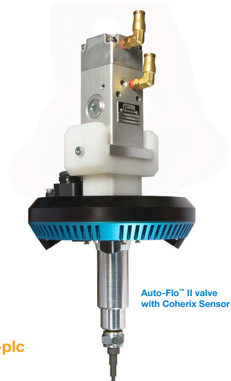
Auto-Flo™ II valve with Coherix sensor

Discover more online : www.nordson.com/process-sentry-plc