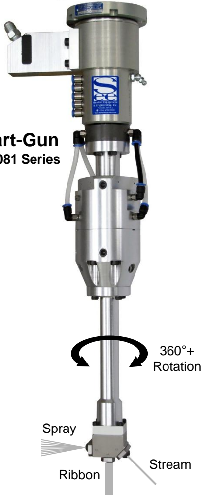
Smart-Gun 2600-081 Series