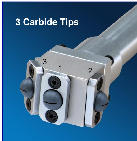
3 Carbide Tips