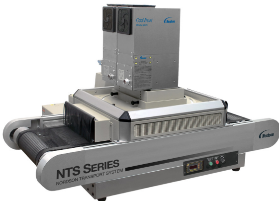
Nordson NTS Series Conveyor with two CoolWave 306I lamp heads, shown with standard lamp bracket to raise and lower lamp.

The lamp-mounting bucket is also designed to incorporate an optional quartz plate kit. The quartz plate, prevents airflow from disturbing the substrate or applied materials. This optional feature also reduces surface temperature of the cured part.