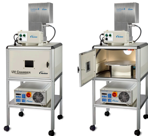
Flexible design of the UV chamber can be customized for varying curing requirements.